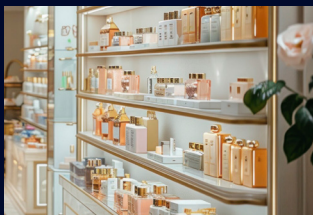
LUXURY GOODS & CPG